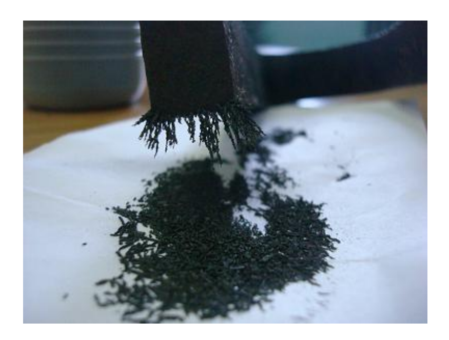
How the magnetic field works